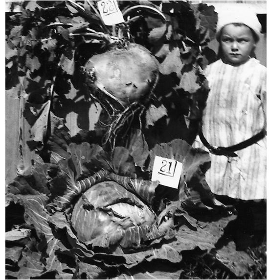
The Aucklund truck farm, Magnolia's very own local produce, was famous for its huge and beautiful produce. In this picture, the young one of the family is even a bit fearful of such beets and cabbages! Circa 1925.