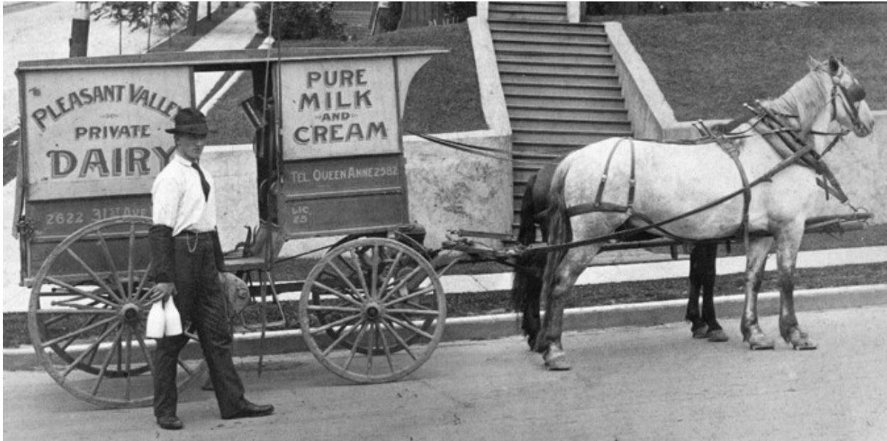
Pleasant Valley Dairy was located where Albertson's is today. Another successful Magnolia farm serving the dairy needs of Magnolia and Queen Anne customers.

With the establishment of Fort Lawton, the Locks, Fishermen's Terminal, the development of the railroad and shipping piers, industrialization was truly born on the Bluff. The population grew and the land was now worth more, but not for farming.